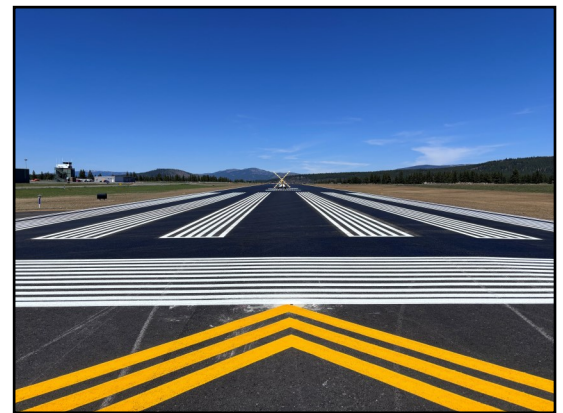
New pavement and fresh paint on Runway 2

saw a 24% decrease in piston departures off Runway 29, a substantial change from 2016-17. Turbo-prop departures off Runway 11 increased 14% compared to 2016-17 but this is mainly because of the new executive hangars on the west end of the airfield that opened in 2019.